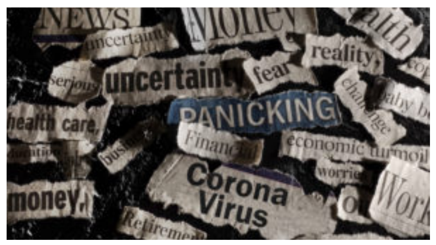
How COVID-19, Politics Are Impacting Our Mental Health