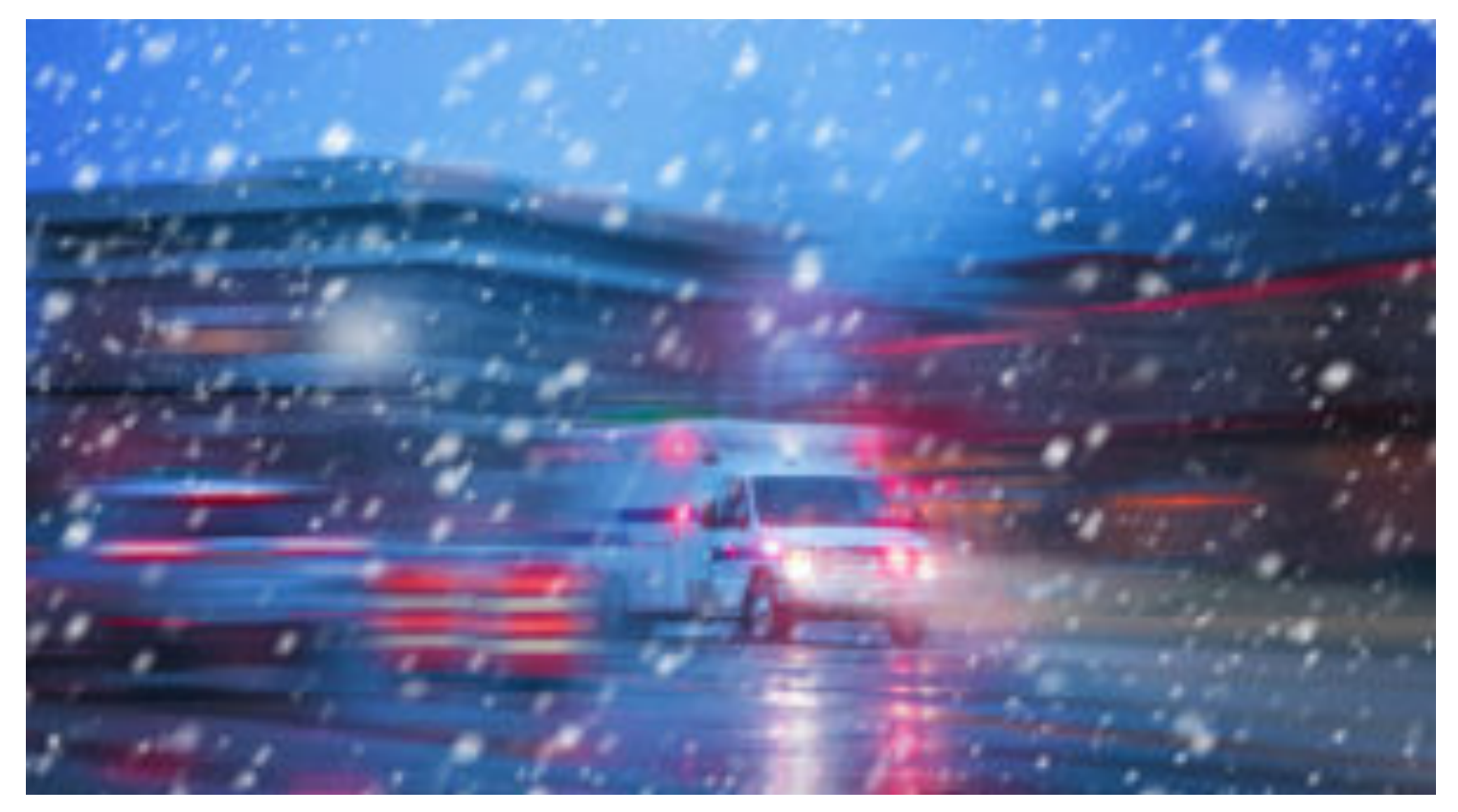
Traffic Fatalities Increased in 2020, But Why?