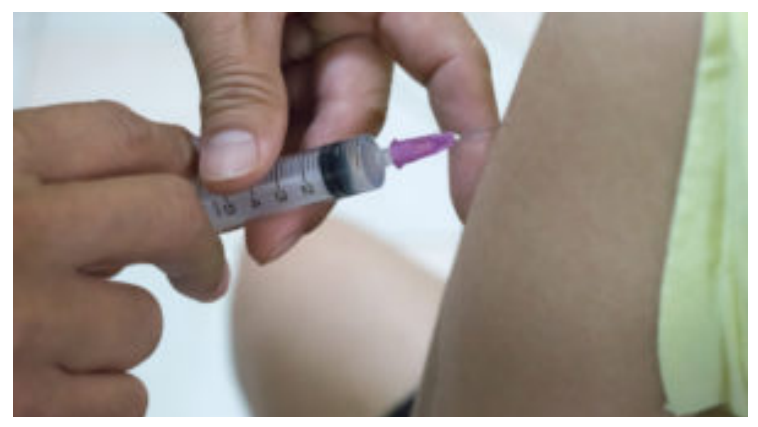
Vaccines 101: History, Safety & Your Rights