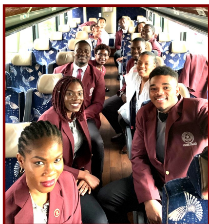
Honors Scholars on their way to Southern University, Baton Rouge