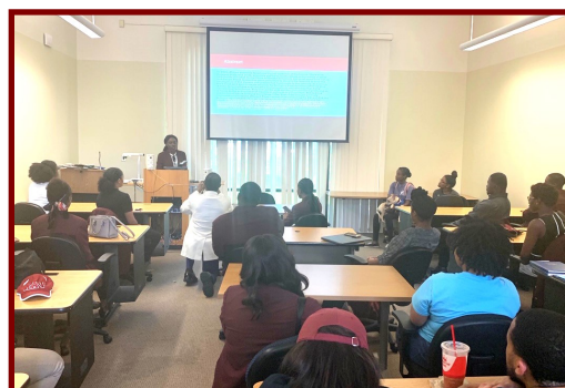
Research presentations at Southern University

curriculum and the many offerings at Texas Southern University.