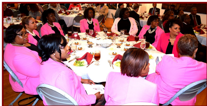
Members of the Tau Omega Chapter of the Alpha Kappa Alpha Inc. Sorority